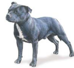
Staffordshire Bull Terrier