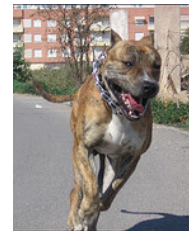
Pressa Canarios – Spanish Pit Bull (American Pit Bull looks very similar)