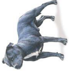
Staffordshire Bull Terrier