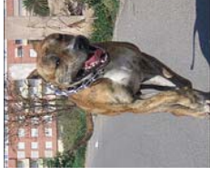
Pressa Canarias – Spanish Pit Bull (American Pit Bull looks very similar)